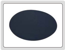
silicon carbide paper (optional)