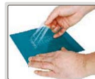
step 2: paste and remove the tape