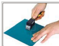
step 1: make grid cutting on surface