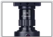
0.5X camera adapter (included)