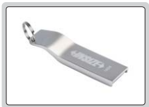
16G USB flash disk (included)