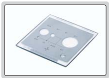
calibration plate (included)