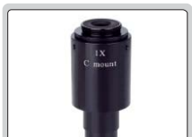
1X camera adapter (optional)