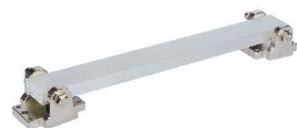
mounting bracket (included)