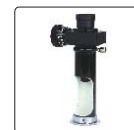
measuring microscope (included)