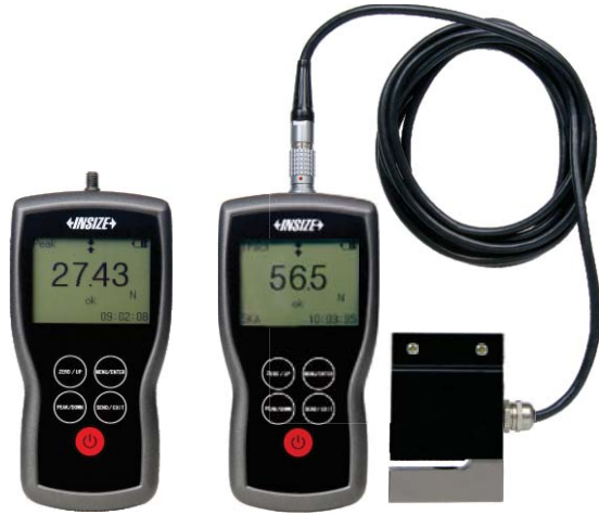
ISF-DF100A type A