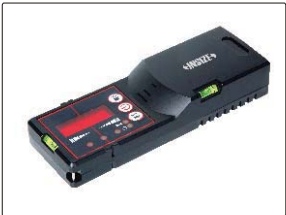
outdoor detector ( optional )